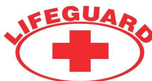
Red Cross Lifeguard