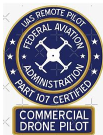
FAA Part 107 Commercial Pilot License