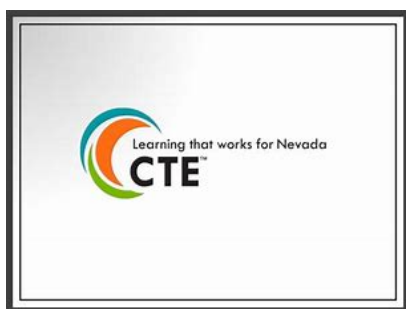
Career and Technical Education