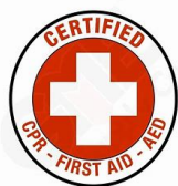
Red Cross First Aid